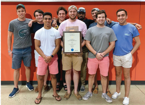
Our undergraduates received their 10th consecutive Peterson Award at a workshop in August 2019.