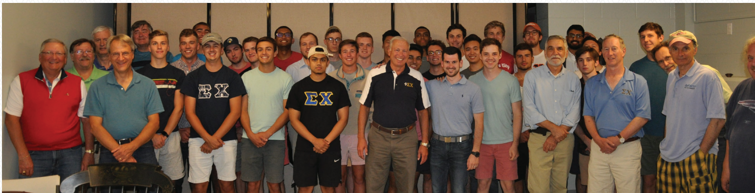
Pictured at the August 2019 Work Party are alumni and undergraduates.