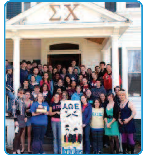
This spring's Derby Days philanthropy raised more than $750.

Desiring to celebrate the history of our chapter, we will host a 60th anniversary on October 15-17 to honor the tradition we have here at Delta Psi. Please join us to reunite with brothers from all generations and relive the days when