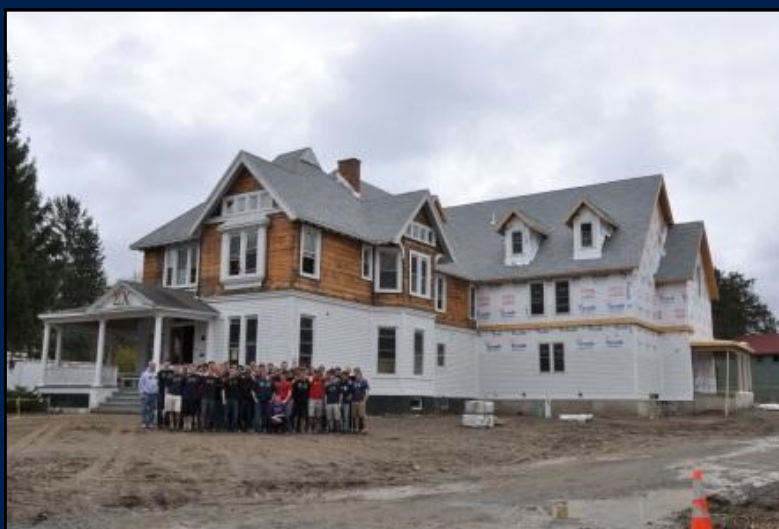
The Delta Psi Chapter gathered outside the new chapter house.