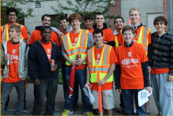
Brothers who volunteered at Saratoga Springs

Delta Psi also participated in Alpha Gamma Delta and RSE's Water Wars, raising money to help a local high school student who was recently diagnosed with Type I diabetes. Last, but certainly not least, the chapter co-sponsored a blood drive on October 2nd with ACACIA. The chapter was able to garner more than 20 blood donors, an effort that earned the appreciation of the Red Cross and the RPI administration!