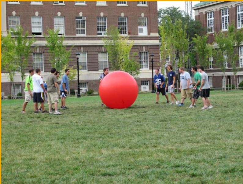
Potential members and Delta Psi Sigs come together to play RPI's signature sport, Pushball

When Delta Psi started the fall semester, we knew that we had a lot of work ahead of us for the ensuing recruitment period. Going into the semester not living in the chapter house presented many challenges; we did not have a central location for events, nor could we show potential members the structure in which they would live for the next few years. We were unsure of the interest that we would draw with 58 Pinewoods under renovation.